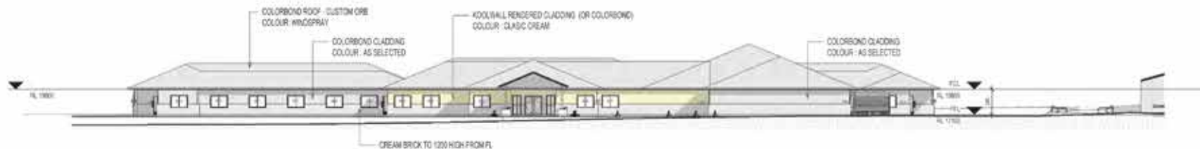
Elevation 1 - a SCALE 1:200