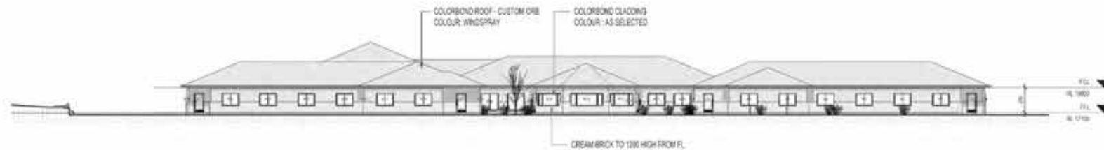
NORTH ELEVATION SCALE 1:200